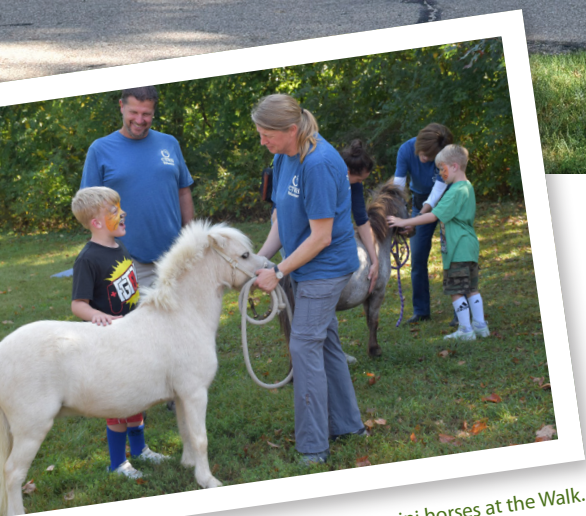
Enjoying the therapy mini horses at the Walk.