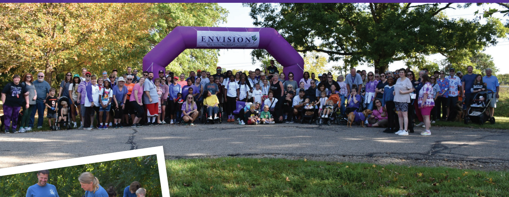
2023 Go the Extra Mile Walk.

Check the events tab on our website. More to be added soon!